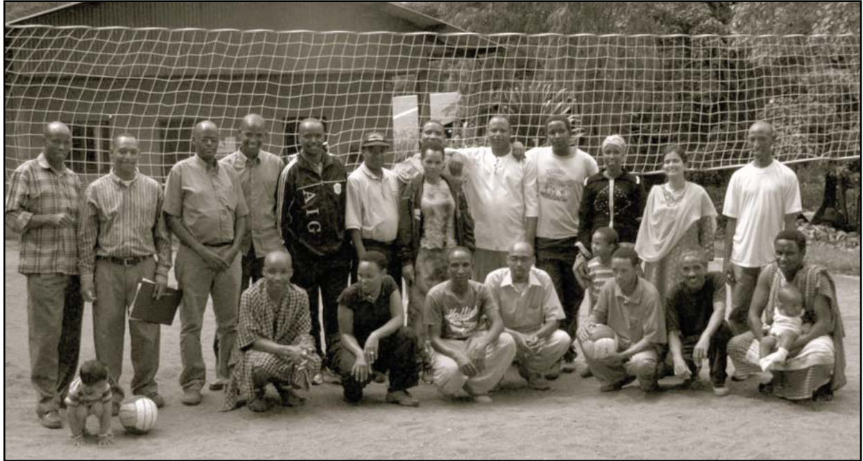
Caption: Volley Ball teams at the first annual Earth Day Gibb's Farm.