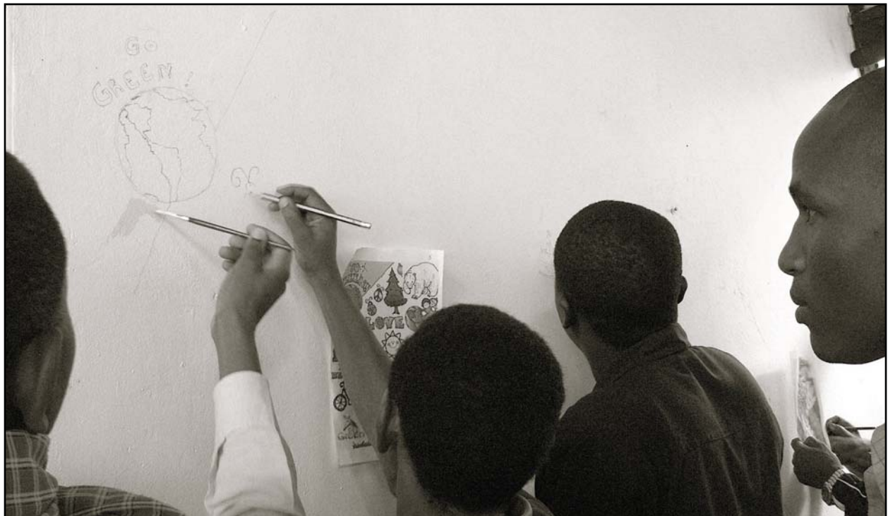
Caption: Earth Day Painting in staff dining room called Uhai, Swabili for life.